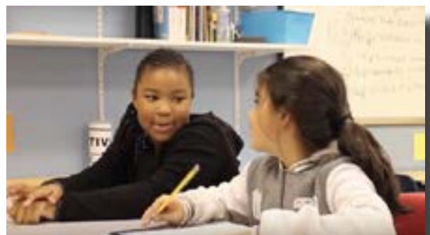
A scene from NHA Learning Centers' "Being Kind is a Way of Life."

Their video, entitled "Being Kind is a Way of Life," won second prize in the 2016 Student Film Contest, sponsored by the Envision Kindness organization. The video was written, directed, and performed by the students and illustrates individual moments in which we have the opportunity to be nice to one another. Well done!