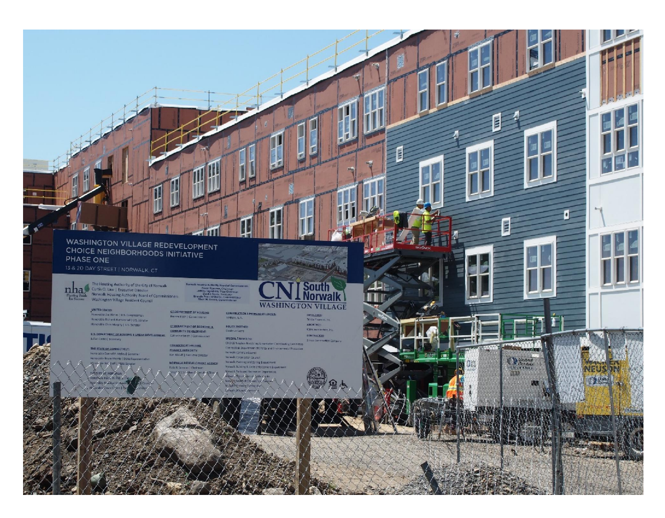
Southeast Elevation of 20 Day Street

The 70 unit Building at 20 Day Street is now weathertight and some of the apartments have been painted and ready for kitchen cabinet. The windows and siding work continues. Substantial completion is now estimated to be mid-July 2018.