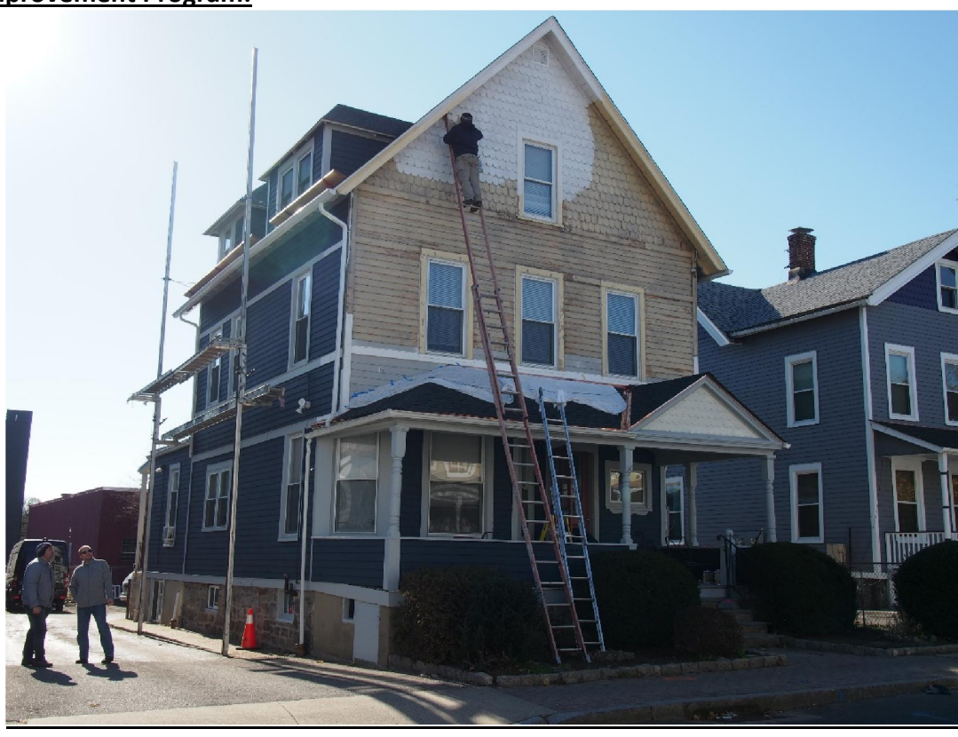
Façade Improvements at a Hanford Place Residence