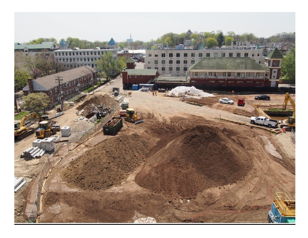
Ryan Park Environmental Remediation

The Park Improvement Plan, lighting, playground equipment and landscaping, will be put out to bid with a completion date anticipated in the autumn.