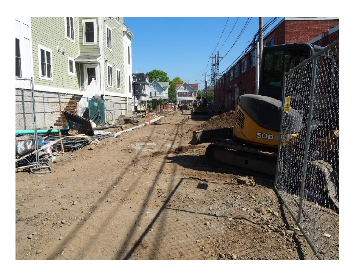
Day Street Extension – Hanford Place to Elizabeth Street