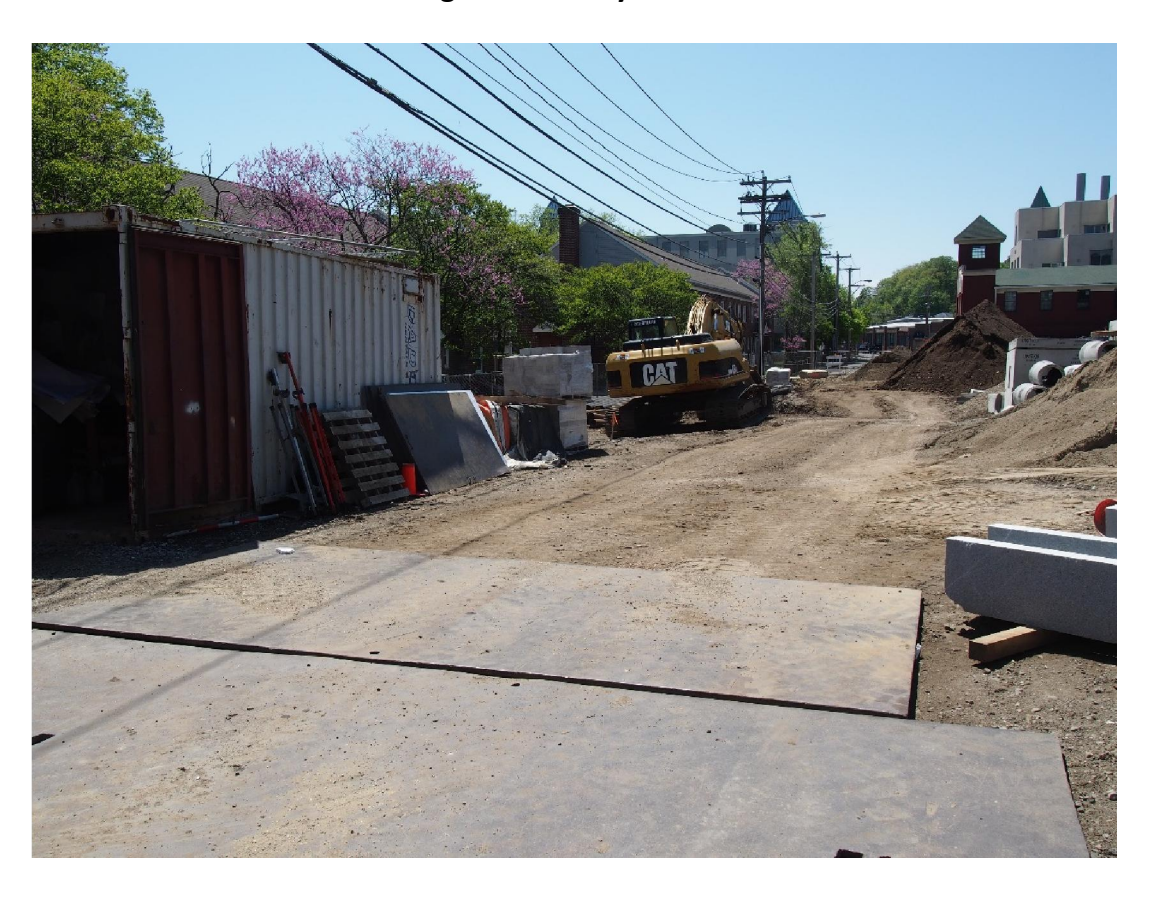
Looking South on Day Street