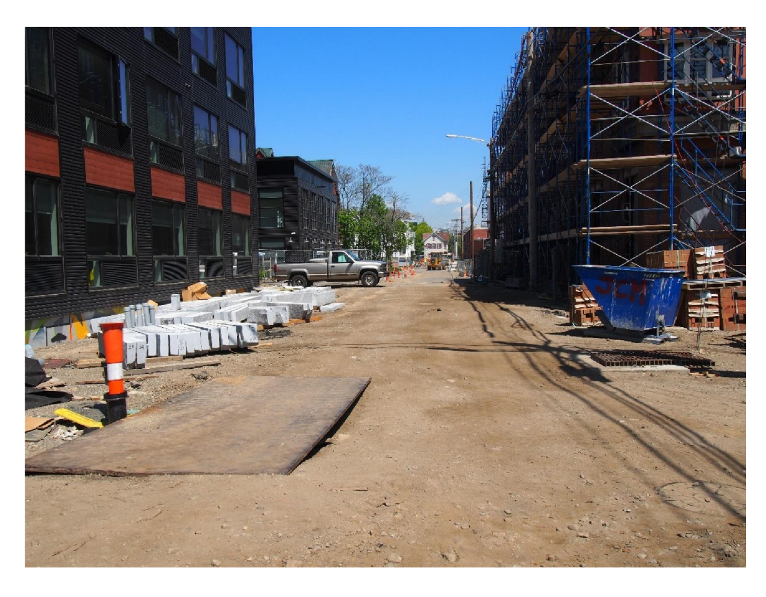
Looking North on Day Street towards Hanford Place