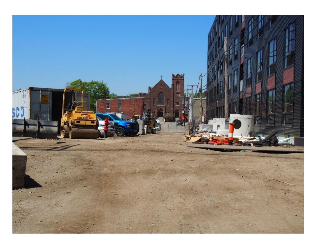
Looking West on Raymond Street