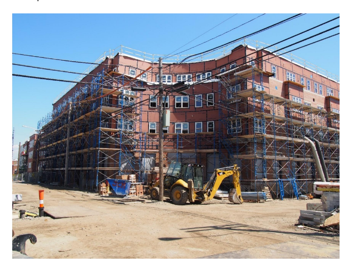
Elevated Intersection at Raymond & Day Street

The intersection of Raymond and Day Street will be elevated approximately six feet to the 100-year floodplain. This will align with the front entry and plaza of the 20 Day Street structure. The overhead power lines and utility poles will be removed and placed underground. Backfilling has been completed on the west side of 20 Day Street and at the corner of Raymond Street. The project is scheduled for substantial completion in the summer 2018.