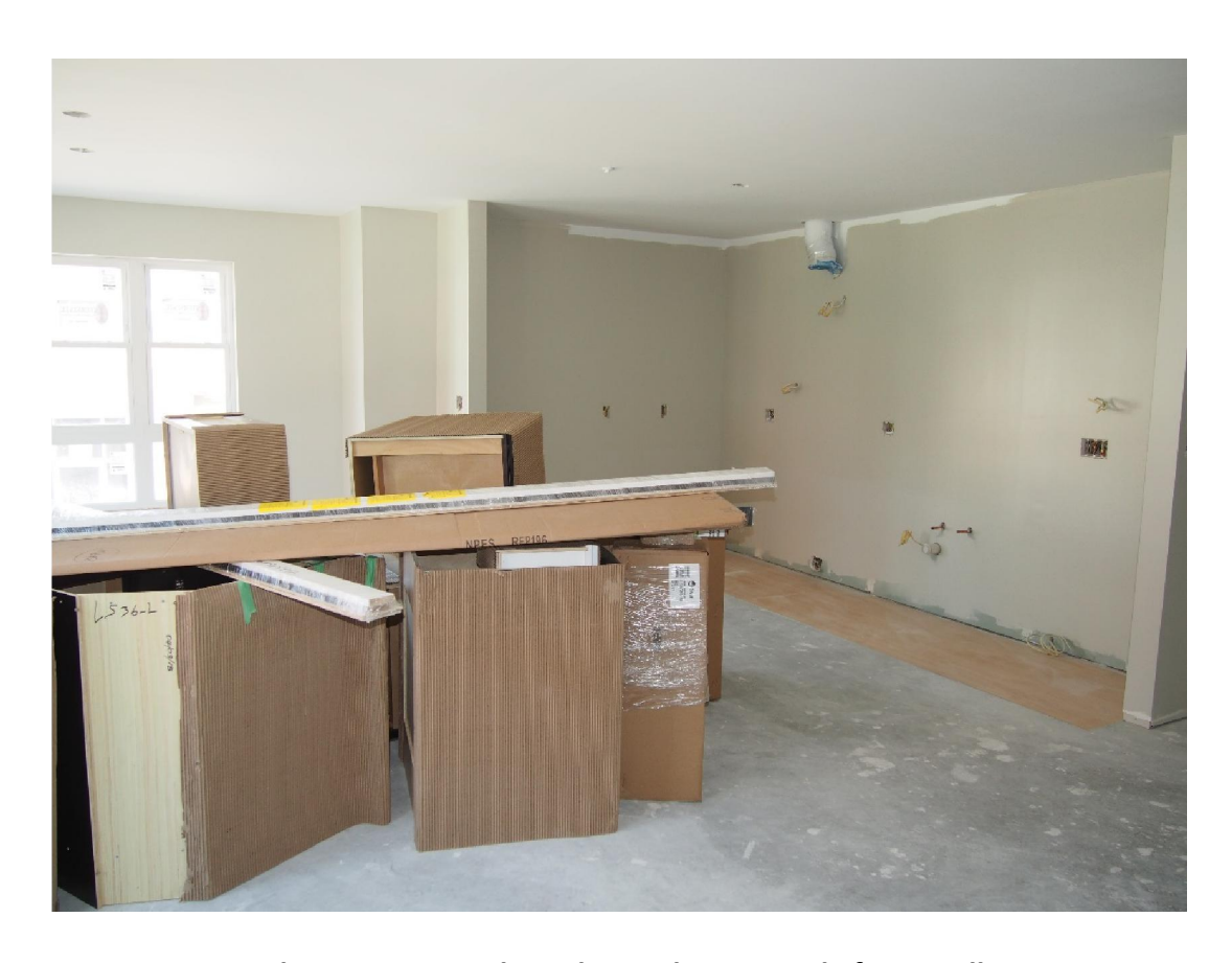
Painted Apartment with Kitchen Cabinets ready for Installation