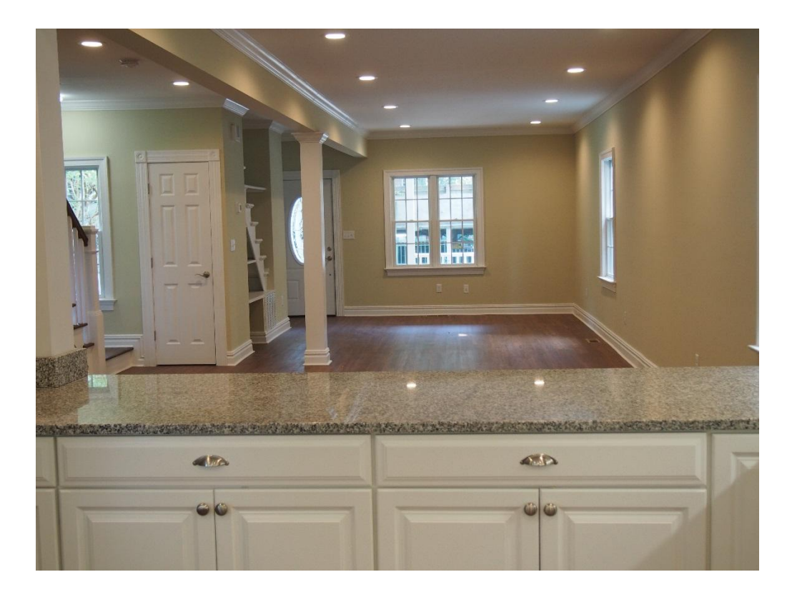
Kitchen & Living Room at 24 Haviland Street

This residential property at 24 Haviland Street was purchased in 2016. Renovations were completed in 2017 and the property is now listed for sale to an income eligible first-time homebuyer.