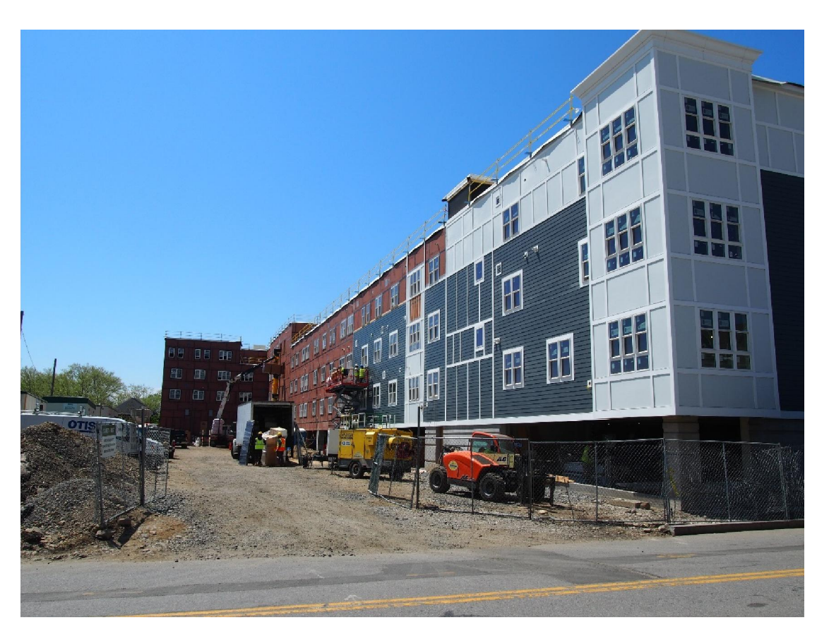
East Elevation of 20 Day Street